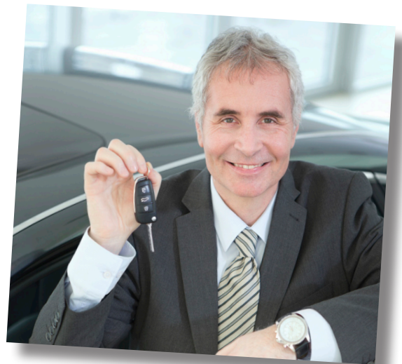
Allan saved $60 a month with our Rate Saver Auto Loan .